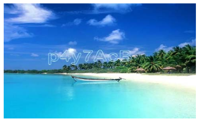
Fig. 2 An example of TransparentCAPTCHA